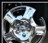
Cosmetic Damage to Hubcaps