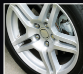
Aftermarket Wheels with no Surcharges