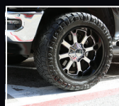
Oversize Tires and Wheels