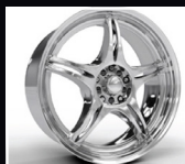
Cosmetic Damage to Chrome/Chrome Clad