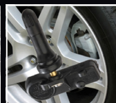
Tire Pressure Monitoring Sensors