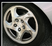
Cosmetic Damage to Wheel Replacement